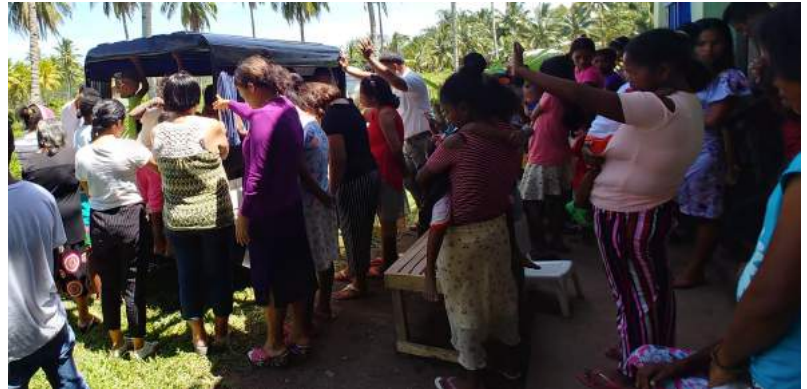
TCLP staff, parents and kids dedicating the multicab to the Lord.

We praise God for His provision of a vehicle for TCLP. We have prayed for this for a while and now in God's timing He provided a multicab for the ministry. This is going to be very useful for the ministry of TCLP. Previously our TCLP kids couldn't cross the river to go to school during the rainy season because the river is dangerously high. Most often, our kids miss a lot of school days because of this. Now with the multicab, our kids can be brought to school via a longer way. The parents at Mt. Zion rejoiced when we informed them that TCLP has a vehicle now. Everyone prayed for this so we all rejoice with this blessing. This will also be used for the other facets of the ministry especially in going out to do our outreach in Baleguian. We used to ride in three or four motorcycles when we go there but now all of us can just use the multicab in one trip. Praise the Lord. We