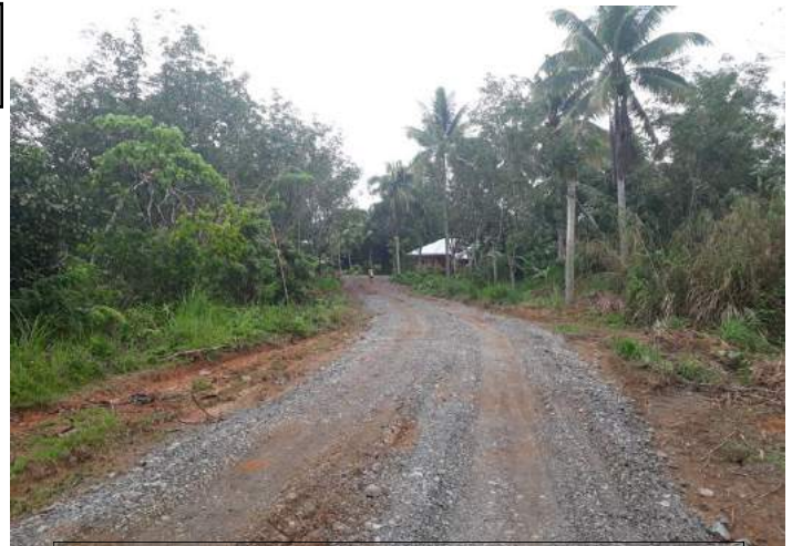
Roads are essential to any type of agricultural development. - Norman Borlaug

Today that steep and muddy trail is no more. God has provided MCN with the means to construct a road into Mt. Moriah, and now it is nearly finished. This new road will help to open Mt. Moriah up to the world. First, it will make the trip in and out of the campus much easier for our students and staff. It will help with the development and expansion of the farming operations. Moving crops to market will now be less burdensome. We'll be able to use the rice mill to generate revenue for school operations, as customers will now be able access our facility. We're very excited for what this upgrade in our infrastructure will bring. Thank you to God, and thanks to those of you He worked through to make this possible.